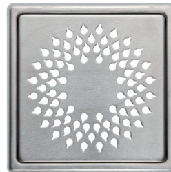
PK200 Drop grate for tiles Prod. code: 7138376 Other designs are available