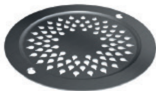
S-Series Drop grate for vinyl Prod. code: 7129507

Different stainless steel grate options are available depending on whether your 59mm floor gully will be installed into a tiled or vinyl floor.